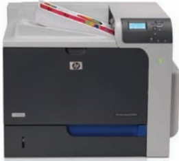
HP Color LaserJet Enterprise CP4025dn Printer