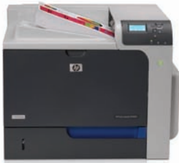
HP Color LaserJet Enterprise CP4025n Printer